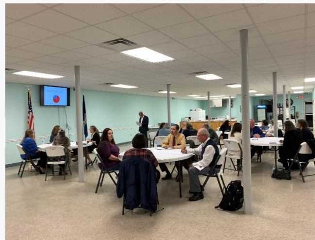
Community Conversation in Pennington Gap, VA

Our hope is that when we leave the conversation, we learn what is important to the community, what are the important issues, and what type of tools we need to share or create to help lift communities.