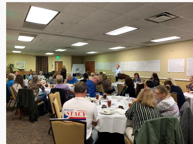
Community Conversation in Bluefield, VA