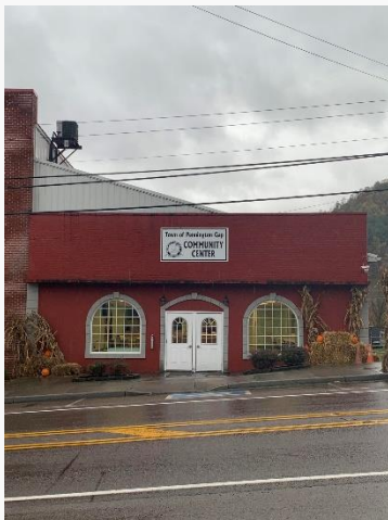
Site: Community Conversation in Pennington Gap, VA